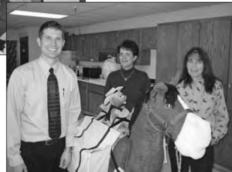
Below: The group briefly reigns in Pecos Pete, Bethesda's favorite equestrian resident.

get to know the residents personally as well.